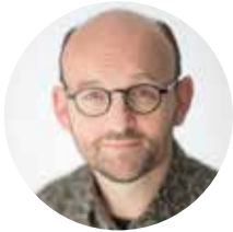
Adrian James Architect